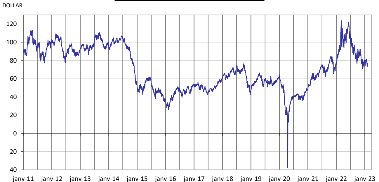
Crude Mineral oil barrel in N.Y since 2011

Concerns over crude supplies after an earthquake shuttered a major export terminal in Turkey and a field in the North Sea shut unexpectedly.